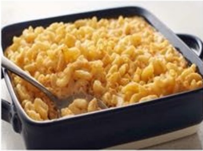
Home made Mac & Cheese